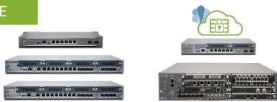
SRX300s – SRX4000s as branch and campus CPE